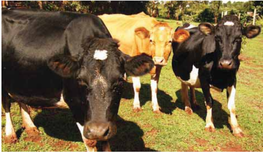
There is a high demand for good quality dairy cows.