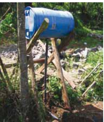
A home made water tank