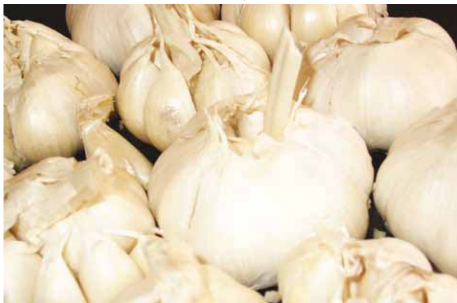
Well cured garlic bulbs ready for market

Garlic can grow well at an altitude of between 500-2000 metres above sea level. The right temperatures for garlic are between 12-24 °C. Extremely high temperatures are not suitable for garlic production. Excess humidity and rainfall interferes with proper garlic development, including bulb formation. The crop is grown in low rainfall areas where irrigation can be practised, especially in early stages when the plant requires enough water to growth. Adequate sunlight is important for bulb development. Garlic develops its flavour depending on sunlight conditions during growth.