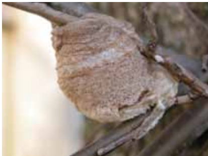
Eggs in Egg Case