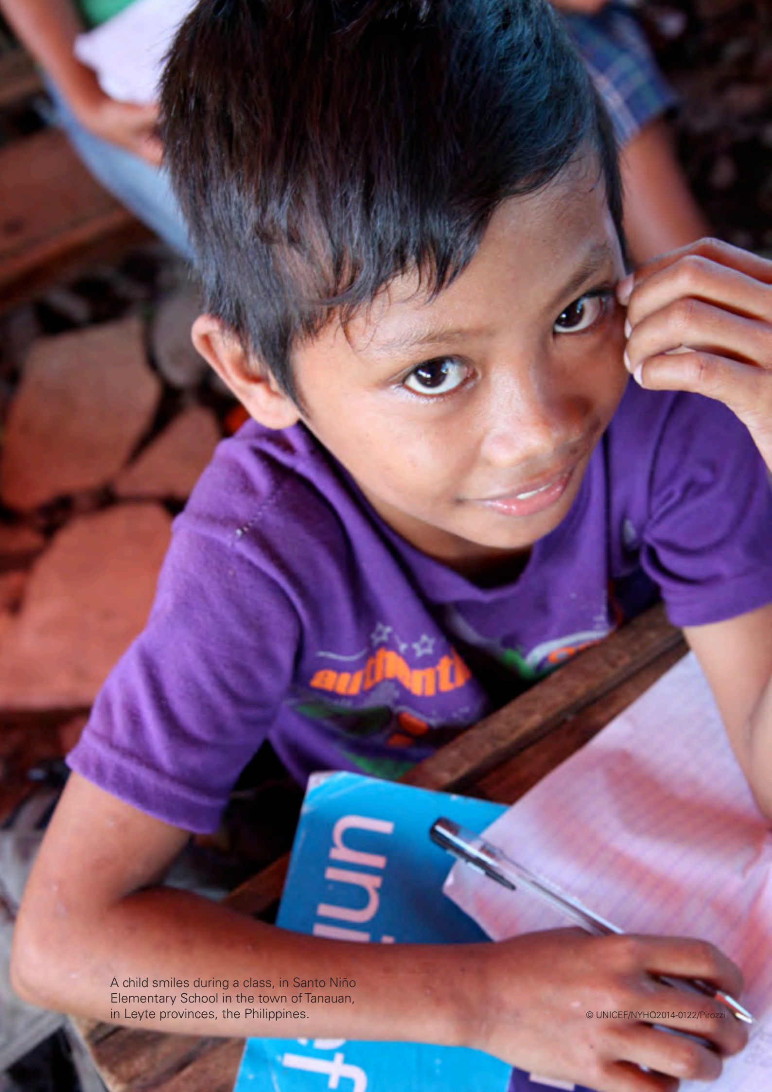
A child smiles during a class, in Santo Niño Elementary School in the town of Tanauan, in Leyte provinces, the Philippines.