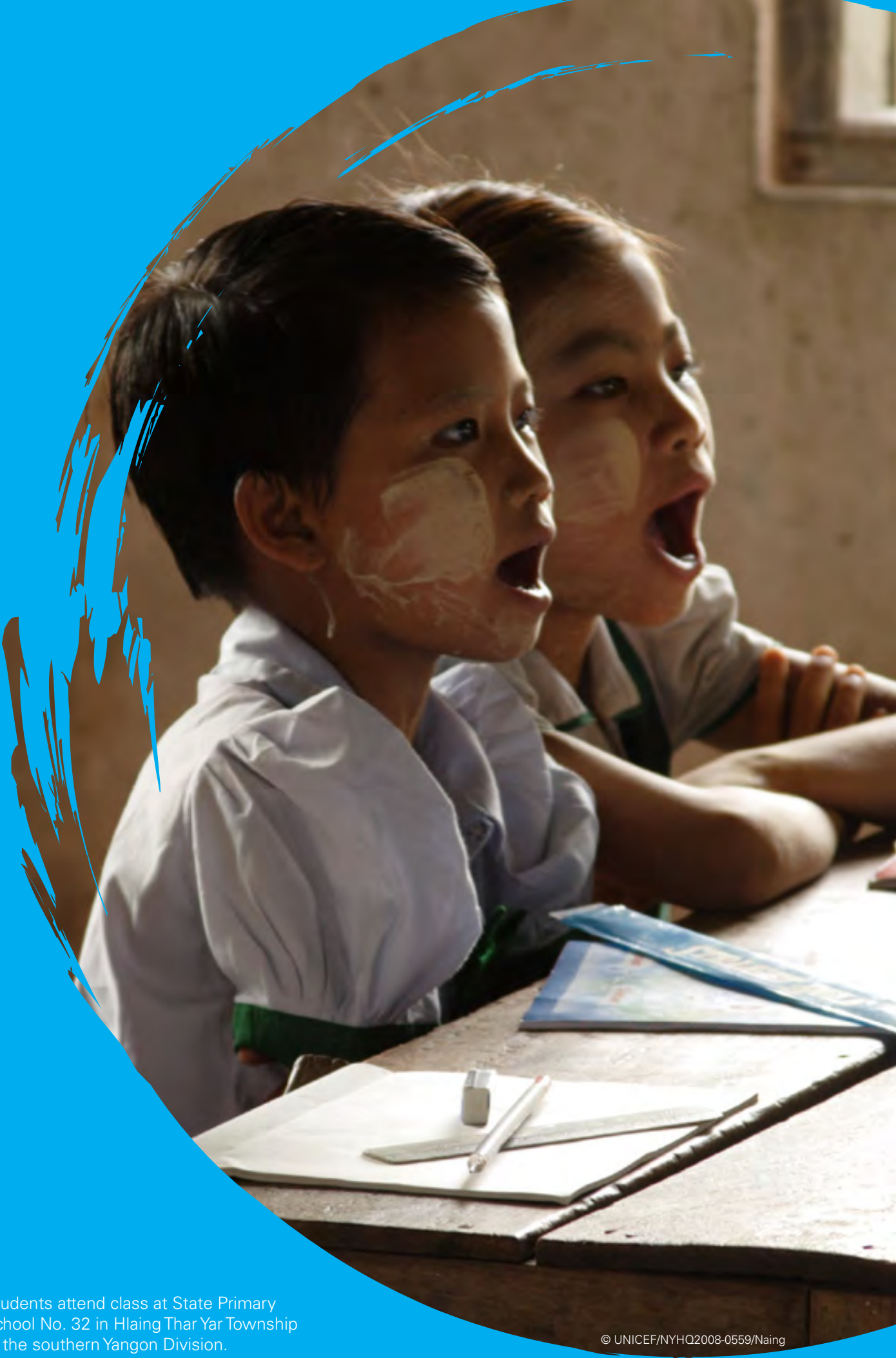
Students attend class at State Primary School No. 32 in Hlaing Thar Yar Township in the southern Yangon Division.