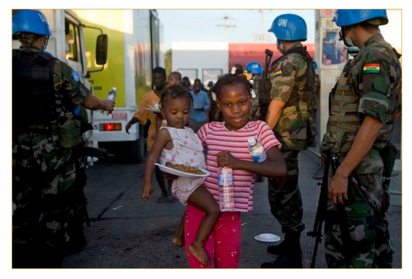
Bolivian United Nations peacekeepers distribute water and meals to the residents of Cité Soleil, Haiti. 15 January 2010.

good communication, negotiation, mediation. These consent-promoting techniques constitute the "soft" skills and processes of peacekeeping—as opposed to the "hard", or technical and military skills—designed to win hearts and minds.