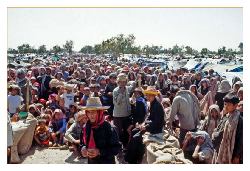
In the late 1970s war and civil strife had devastating effects on Kampuchea, causing hundreds of thousands of people to flee their homes and seek food and refuge in neighboring Thailand. UN relief agencies and cooperating independent groups responded to the crisis by helping to establish refugee camps along the border and taking in food, medical supplies and other essentials. Some Kampuchean refugees living in crowded conditions along the Thai-Kampuchean Border. 1979. 01 January 1979.

What made it possible to unlock these intractable conflicts for Burton was the application of human needs theory through the problem-solving approach. Needs theory holds that deep-rooted conflicts are caused by the denial of one or more basic human needs, such as security, identity, and recognition. The theory distinguishes between interests and needs: interests, being primarily about material goods, can be traded, bargained and negotiated; needs, being non- material, cannot be traded or satisfied by power bargaining. However, non-material human needs are not scarce resources (e.g., territory, oil, minerals, and water) and are not necessarily in short supply. With proper understanding, conflicts based on unsatisfied needs can be resolved.