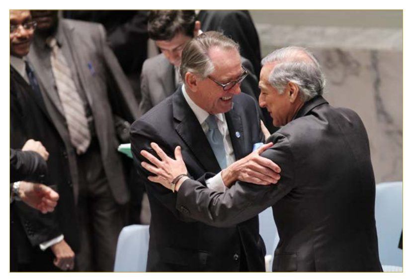
Deputy Secretary-General Jan Eliasson (centre) greets Heraldo Muñoz, Minister for Foreign Affairs of Chile and President of the Security Council for January, at the Council's meeting on post-conflict peacebuilding. 14 January 2015.

During the 1990s and at a gathering pace in the first two decades of the twenty first century, there was a significant shift away from "top-down" peacebuilding, whereby powerful outsiders act as experts, importing their own conceptions of conflict and conflict resolution and ignoring local resources in favour of a cluster of practises and principles referred to collectively as peacebuilding from below. The conflict resolution and development fields have come together in this shared enterprise. John Paul Lederach, a scholar-practitioner with practical experience in Central America and Africa, is one of the chief exponents of this approach. The priority for peacekeeping and conflict resolution is to develop widening participation and local ownership of peacekeeping deployments and to strengthen and balance the civilian content and capacity of missions with the core military composition typical of conventional peacekeeping. These developments are dealt with in Lesson 8. In the past two decades, also as part of this trend of wider participation and local ownership, efforts have been made to make peacekeeping open to more sensitivity to cultural values and diversity, including gender equality.