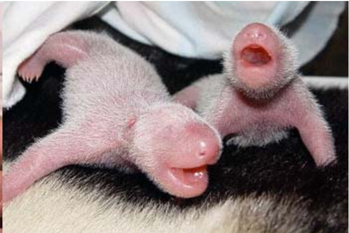
Izquierda: Oso negro de un día de nacido Arriba: Dos osos panda de un día de nacidos

Los osos recién nacidos están muy pequeños cuando nacen.